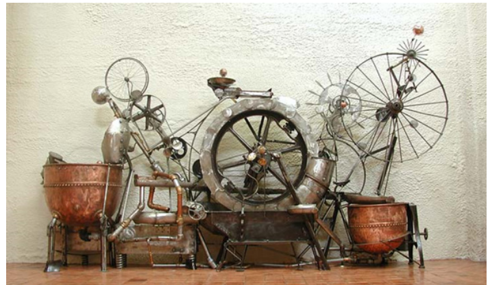
Andrew Smith, Moon Pool , 2004

When students are finished drawing their machinery parts, instruct them to outline the pencil lines with charcoal or chalk pastel. Students will then take their finger (or a blending stump if available) and "shade" the image with the charcoal smudges.